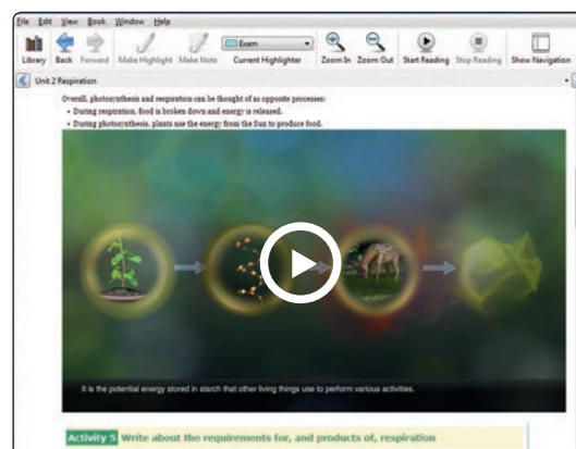
Animation from Platinum Natural Sciences Grade 8 Learner's Book – Enhanced eBook

Access is dependent on connectivity, device and operating system.